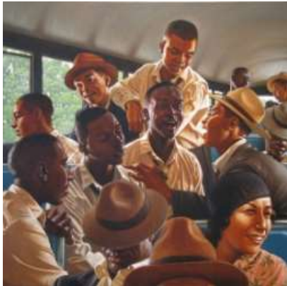
“Game Bus” by Kadir Nelson

While poets are encouraged to visit the museum to view the works in person—along with the “Excellence in Fibers Exhibit” (until March 15)—photos of the 2020 art pieces and contest guidelines are also available on the Museum’s website, muskegonartmuseum.org .